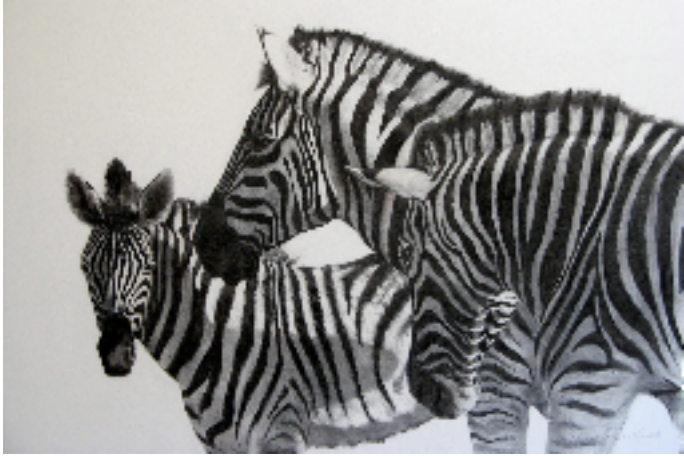
Zebra Family, Etosha NP Pete Marshall - charcoal