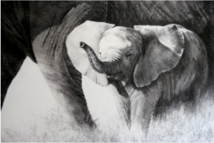
Curious and Curiouser Pete Marshall - charcoal